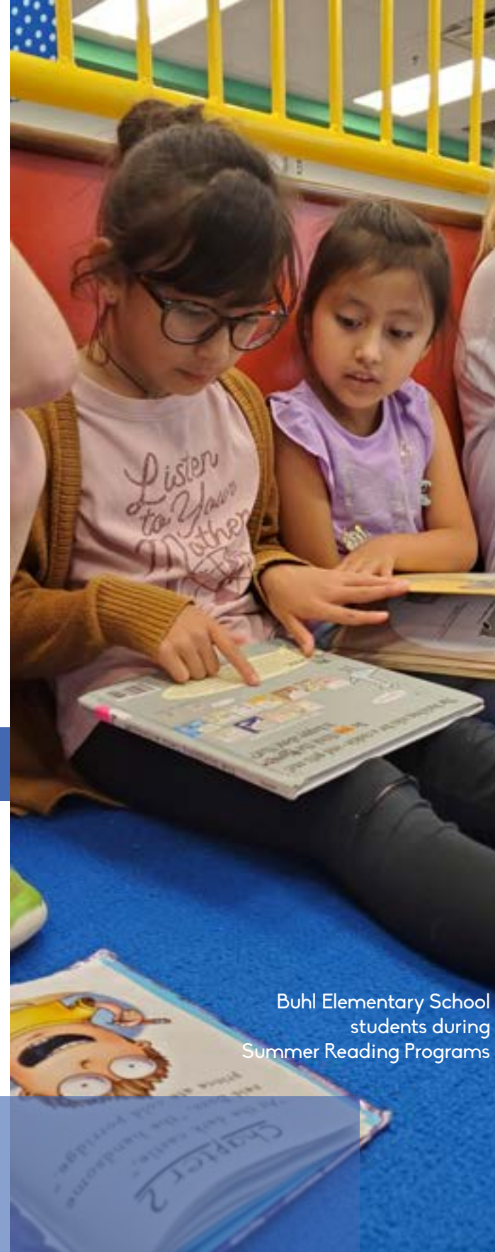
Buhl Elementary School students during Summer Reading Programs

Actively engaging parents through one-on-one sessions, newsletters, parent nights, and family events.