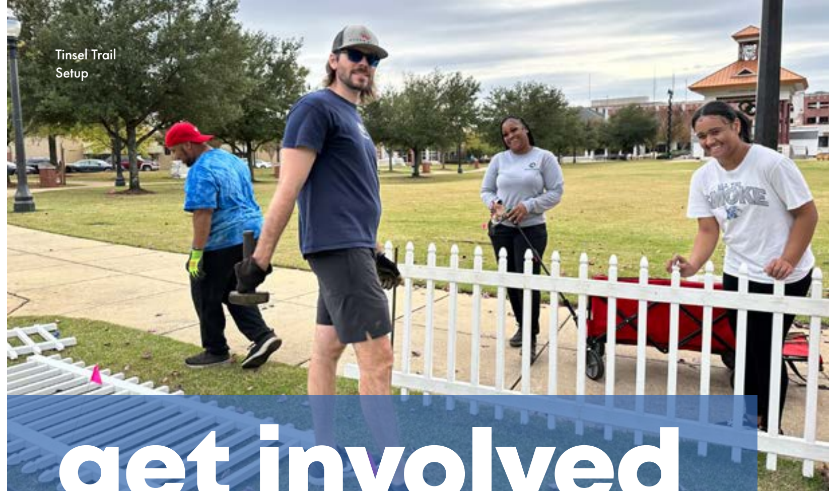
Tinsel Trail Setup

Tinsel Trail is free for the whole community to enjoy from November to January each year. Trees are sponsored and decorated by community businesses, organizations, and individuals.