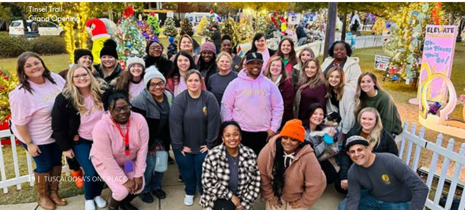
Tinsel Trail Grand Opening

For information on ways you can support Tuscaloosa's One Place, A Family Resource Center, visit tuscaloosaoneplace.org or contact Kevin Besnoy at kbesnoy@tuscaloosaoneplace.org .