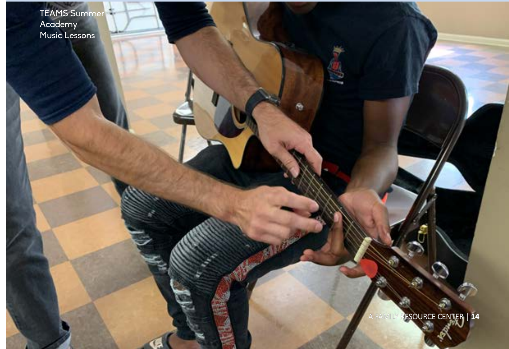
TEAMS Summer Academy Music Lessons

TEAMS had a participant who successfully completed the program in May of 2022 who graduated high school and was accepted into a prestigious art college in Philadelphia, PA. Both the student and his parents credit the TEAMS staff involvement for their son's motivation and behavioral change.